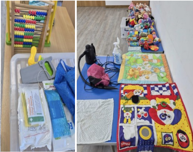
Above: Some of the huge cleaning efforts from last week

Every volunteer adds something so special to this group and helps make it such a wonderful place for the children, parents, carers and childminders who make, and have made, such fond memories here. You are so appreciated.