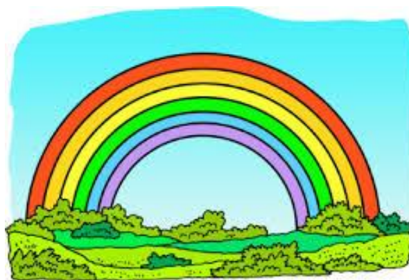
God never forgets His promises

So, I wondered what your favourite promises are. Which ones have been completed and what are you still waiting for? Do you have any peculiar promises coming your way either from a friend or loved one or from God? What promises have you made?